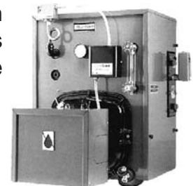
V8 Series Steam Boiler with Tankless Heater

American Standard's ClearTap, the most elegant, easy-to-use, and rugged filter faucet in the world.