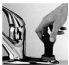
Drop-In Patented Filter Cartridge

American Standard's ClearTap, the most elegant, easy-to-use, and rugged filter faucet in the world.