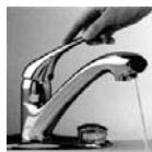
Filtered Water On Demand

ClearTap American Standard Water Filtering Systems