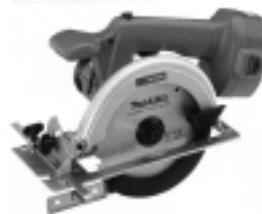
Pictured Clockwise From Top Right: Get-away to Orvis Fly-Fishing School; ESQ Mens' 550 SLX Chronograph Watch; Makita Cordless Circular Saw; Epiphone Les Paul Electric Guitar