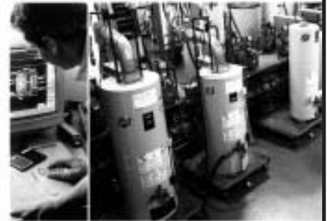
Bradford White's Research and Development Laboratory in Middleville, MI

Bradford White's state-of-the-art R&D facility, an independent laboratory, and has also undergone extensive field testing.